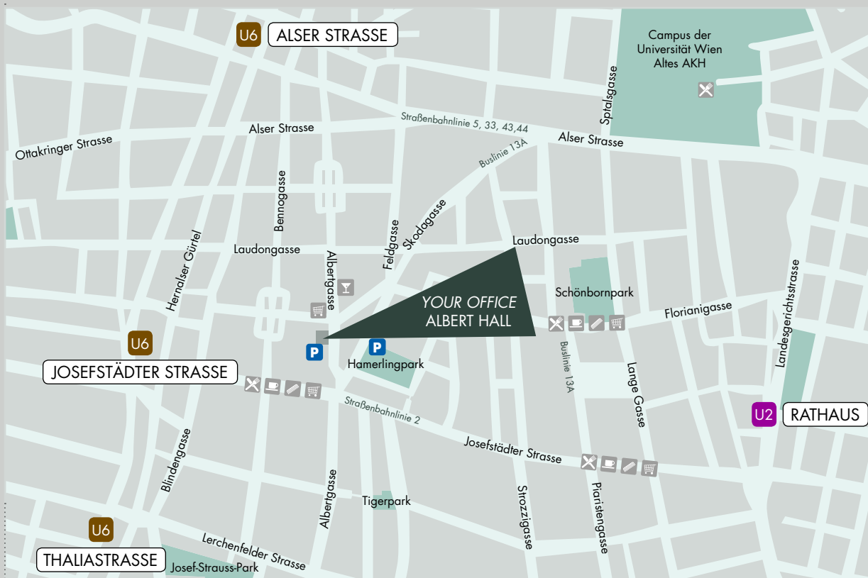
Location ALBERT HALL